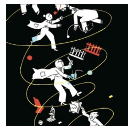
Many results that are rigorously proved and accepted start shrinking in later studies.

But the data presented at the Brussels meeting